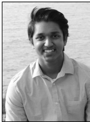
2 Yes! perfectly formatted for yearbook success!