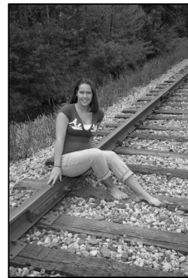
3 NO! too far away and difficult to crop